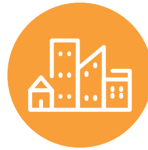
Sustainable cities and communities