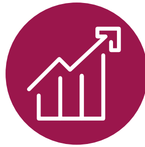
Decent work and economic growth