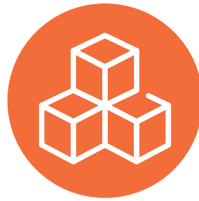
Industry, innovation and infrastructure